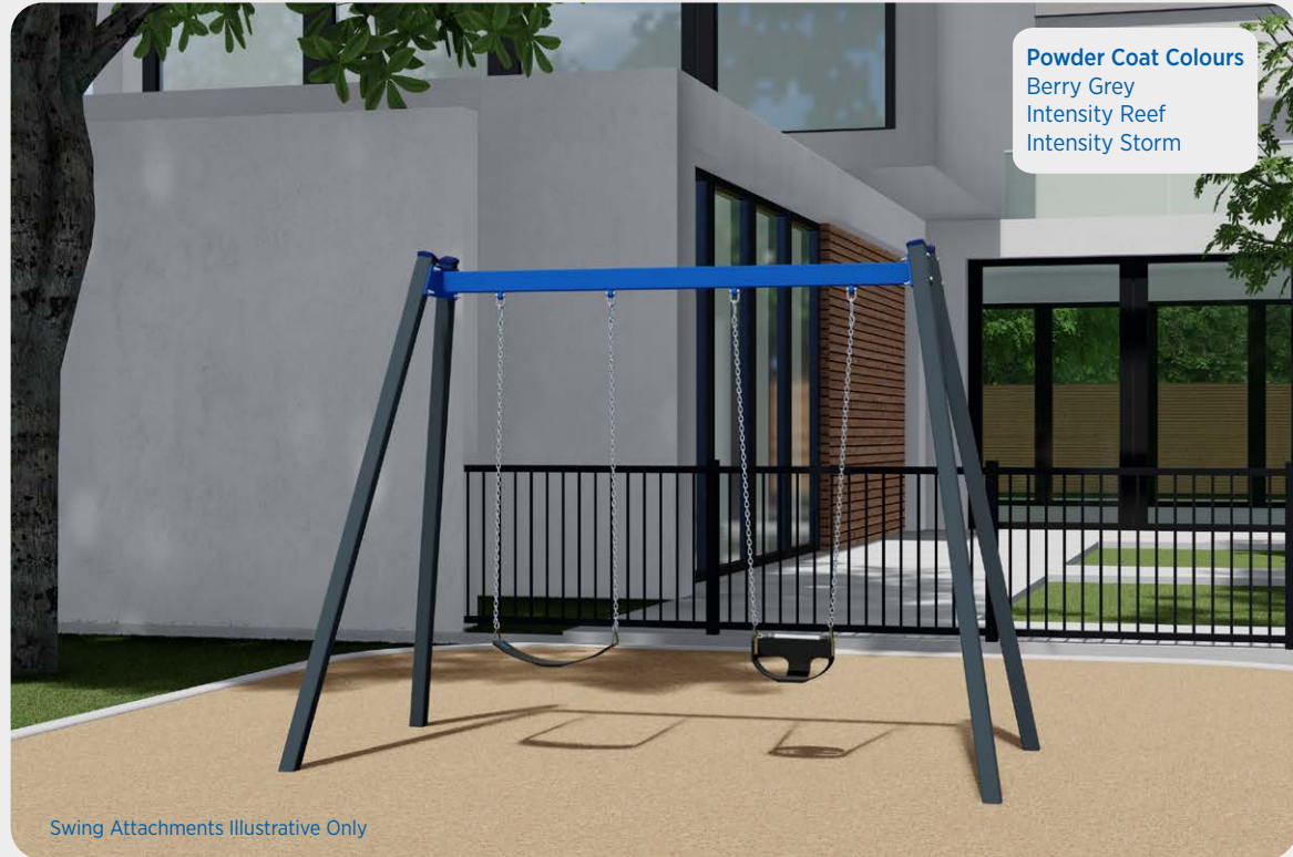
Swing Attachments Illustrative Only

Note: This swing frame is intended for Supervised Early Childhood Settings only