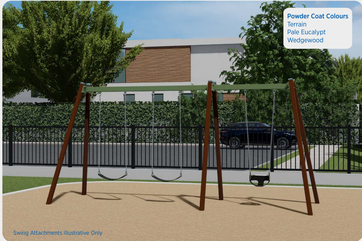
Swing Attachments Illustrative Only

Note: This swing frame is intended for Supervised Early Childhood Settings only