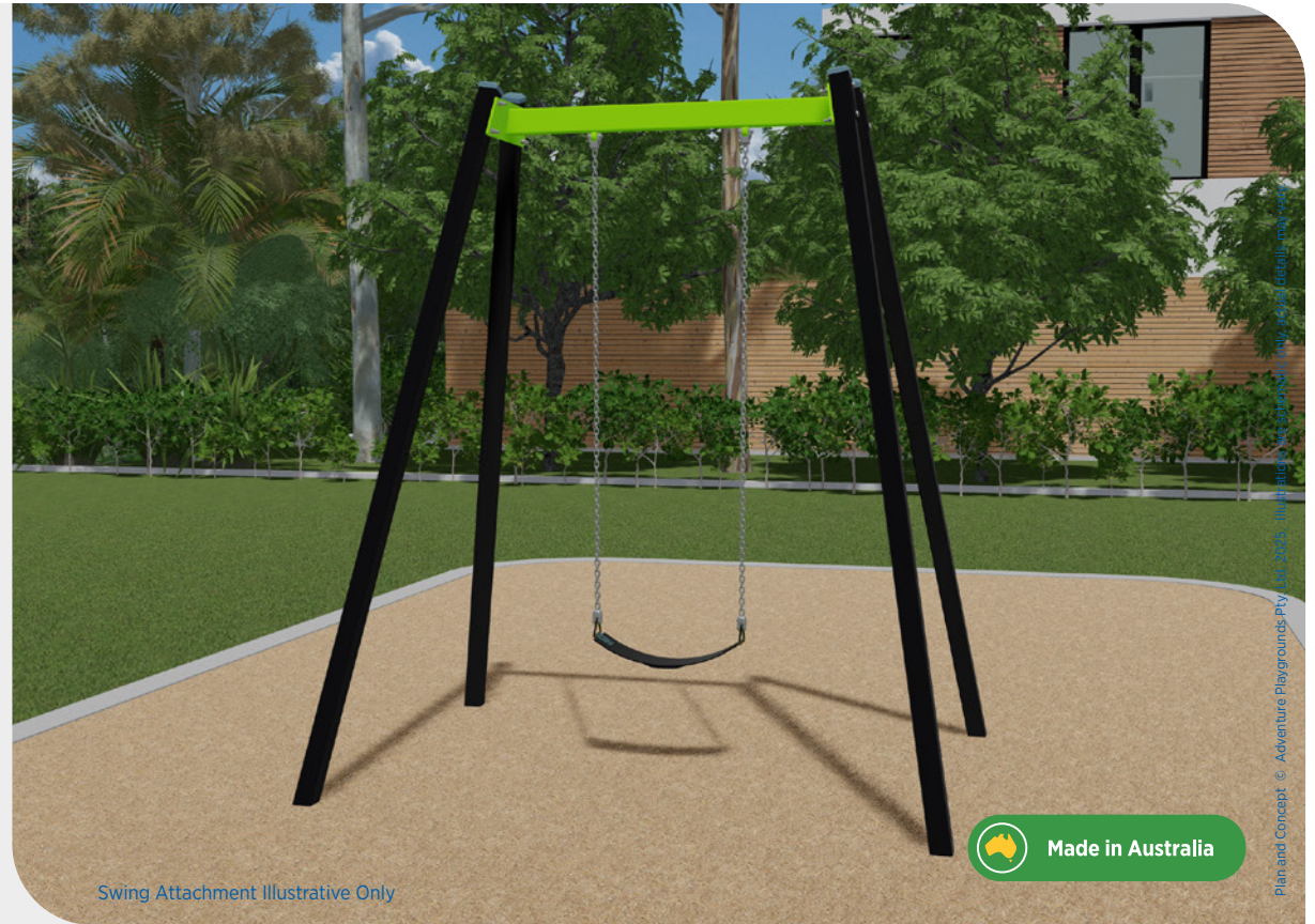
Swing Attachment Illustrative Only