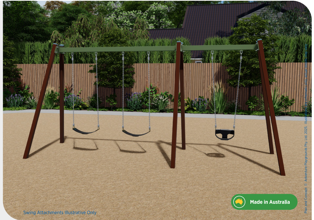
Swing Attachments Illustrative Only

Note: This Swing Frame Is Suitable For Supervised Early Childhood Settings Only